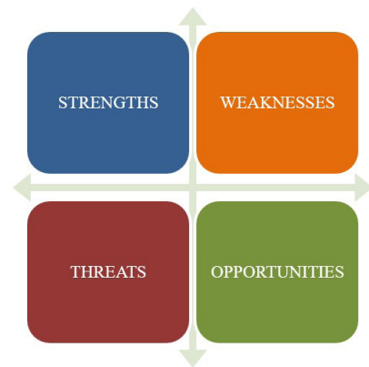
Figure 3: SWOT matrix.

The development of the matrix has been treated under three considerations: socio-economic, environmental and operational, thus trying to encompass the main aspects involved in an automated terminal in a sustainable manner.